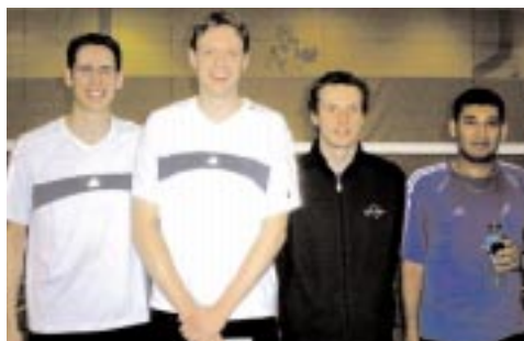
'A' Draw Men's Doubles L to R: