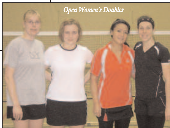
Open Women's Doubles