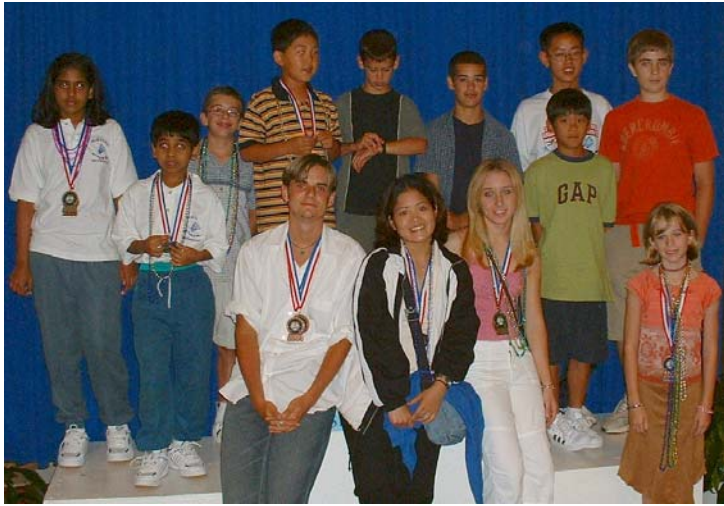
Midwest Juniors at Junior Nationals. Article on page 5. For a better look at these players (bigger picture, better quality), check out the photo album page on our website!